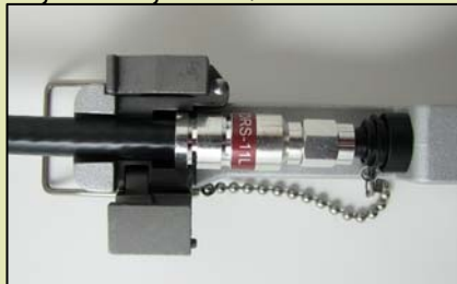
Open the 7/11 top gate and insert connector