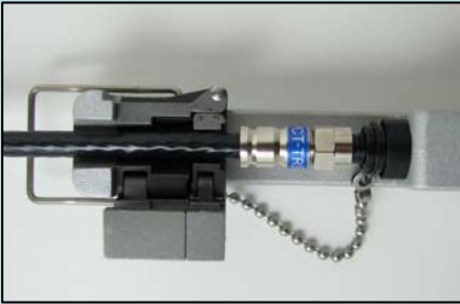
Lift top gate to open and insert connector.