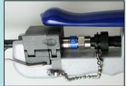
Close handle to compress.