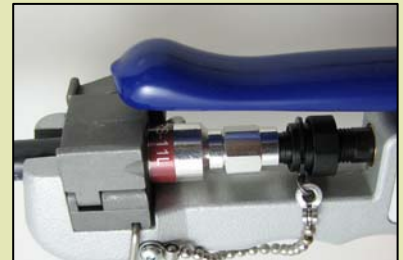
Close top gate. Then close handle to compress.