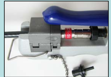
Close top gate. Then close handle to compress.

Note: When not using the tool, the mandrel should be stored in the plunger to prevent breakage of the retention chain.