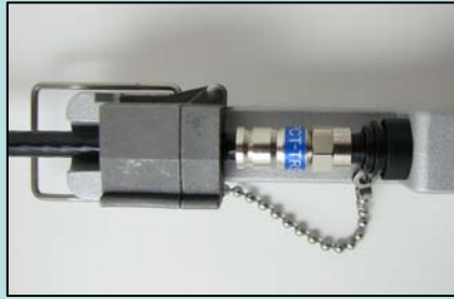
Close top gate.