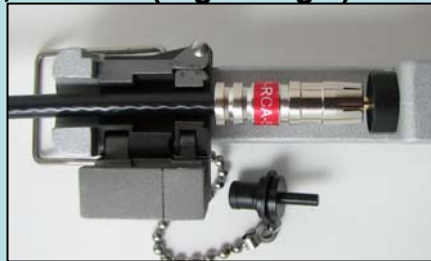
Lift top gate to open and insert connector.