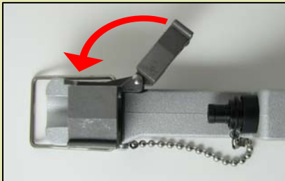
Swing the 6/59 gate out to the side of the tool.