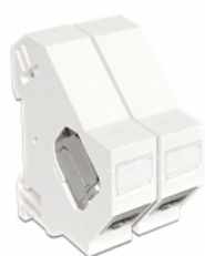
Anwendungsbeispiel mit Stecker