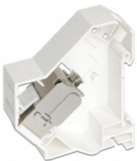
Anwendungsbeispiel mit Stecker